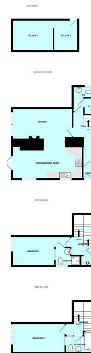
Made with Mergin ©2026